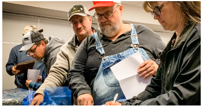
Extension Participants Examine Hay Samples.

Grazing systems are built to be unique and operate uniquely, by understanding the situations, we can create a holistic approach to ensure that goals of producing high-quality beef cattle, minimizing loss, and maximizing resources are met. 35 Producers attended 3 Livestock Feeding Programs, and 90% of those are now forage testing. It's estimated that if producers engage in BMP's outlined in the program, they will decrease their risk of loss by 75%.