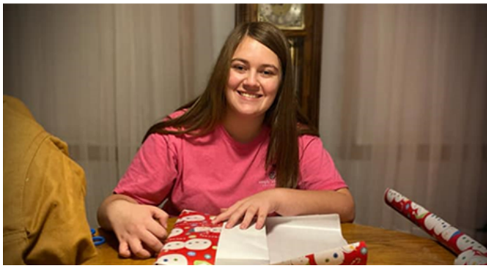
4-H Teen Clun Adopts a Family for Christmas.