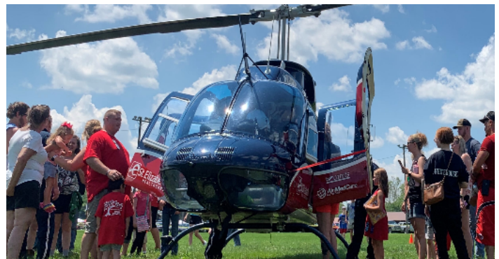
Farmers' Market clients lined up to tour Air Med Helicopter at Community Health Day.

A recent service project that Pendleton County 4-H teens completed was delivering Valentines to local nursing homes. Another recent activity completed by 4-H teens was providing Christmas gifts for a local family (4 children) in need. Pendleton County 4-H adopted a family of 4 kids for the holiday season. The 4-H Council donated $400 that was used to purchase for gifts on the family's wish list.